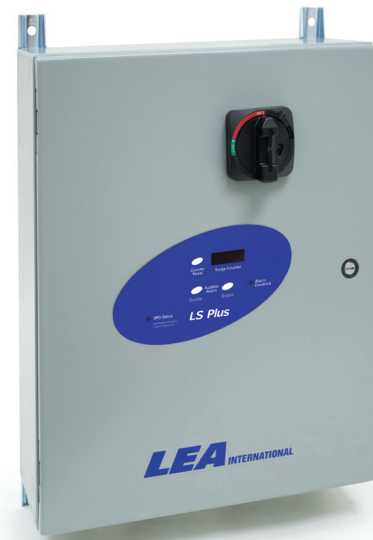
LS Plus Series

The LS Plus is a compact modular surge protection device. This unit is listed to UL 1449 3rd Edition using thermal protection to maintain performance ratings. The LS Plus is designed to be installed quickly and serviced easily to eliminate downtime. A robust surge capacity up to 300 kA and fully loaded diagnostics package make this a versatile SPD for any application.